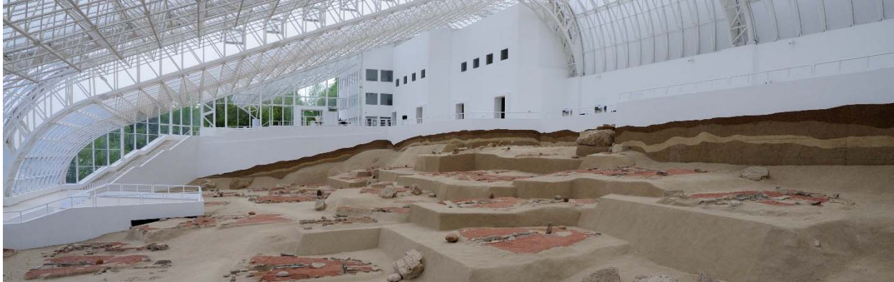
Stoune age museum, Lepenski Vir

Lepenski Vir (Lepen Whirl) is an important Mesolithic archaeological site located in Serbia in central Balkan peninsula. The latest radiocarbon and AMS data suggests that the chronology of Lepenski Vir is compressed between 9500/7200-6000 BC. There is some disagreement about the early start of the settlement and culture of Lepenski Vir. But the latest data suggest 9500-7200 to be the start. The late Lepenski Vir (6300-6000 B.C.) architectural development was the development of the Trapezoidal buildings and monumental sculpture[1]. The Lepenski Vir site consists of one large settlement with around ten satellite villages. Numerous piscine sculptures and peculiar architecture are testimony to a rich social and religious life led by the inhabitants and the high cultural level of these early Europeans.