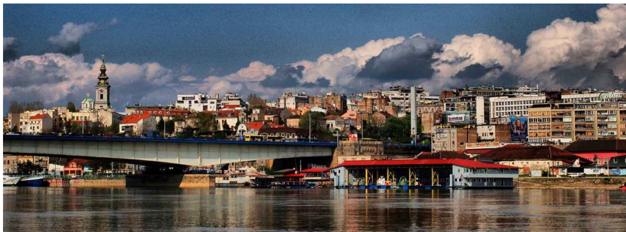
Belgrade, view from the River Sava