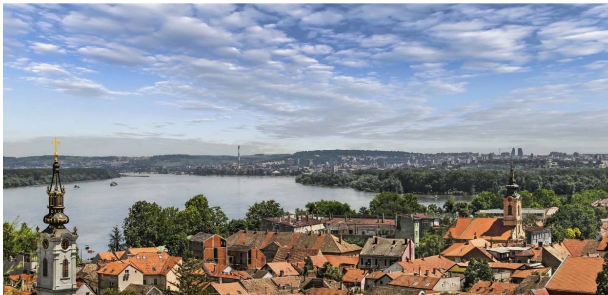
Belgrade, view from River Danube

Belgrade, arrival of the participants, transfer from the Airport Nikola Tesla in Belgrade to the Hotel UNION in the downtown of Belgrade. Welcome Dinner with Serbian Team!